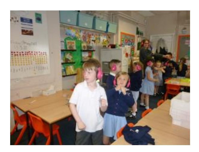
5 - Learning through Now Press Play