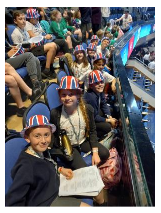
2 - Young Voices 2022