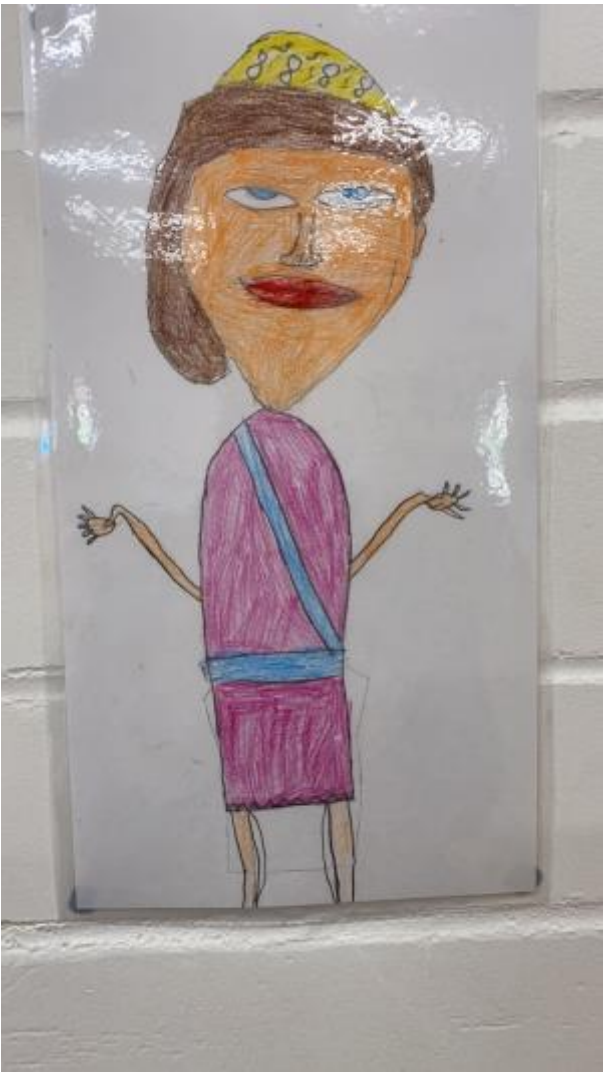
9 - By far my favourite picture of the Queen.....